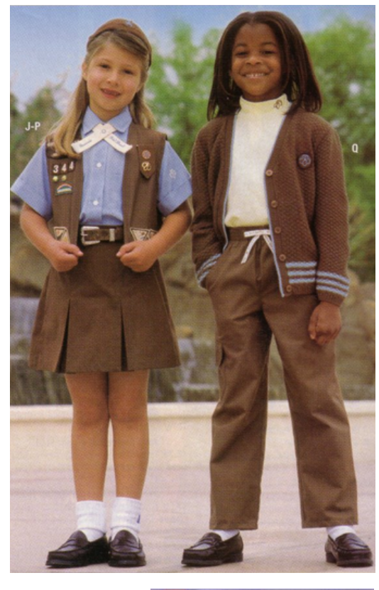
Daisy Uniform, GS Catalog 2007