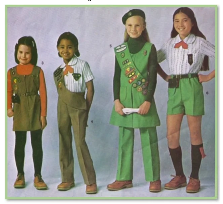
Various levels of Girl Scouts in Uniform 1980